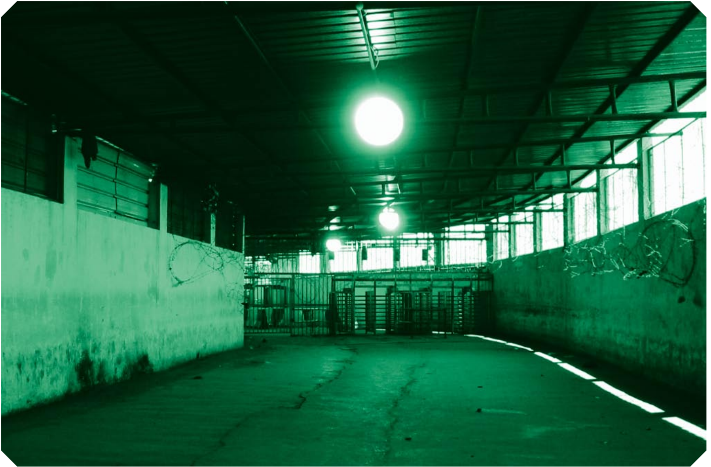
Erez checkpoint in Gaza (2003)