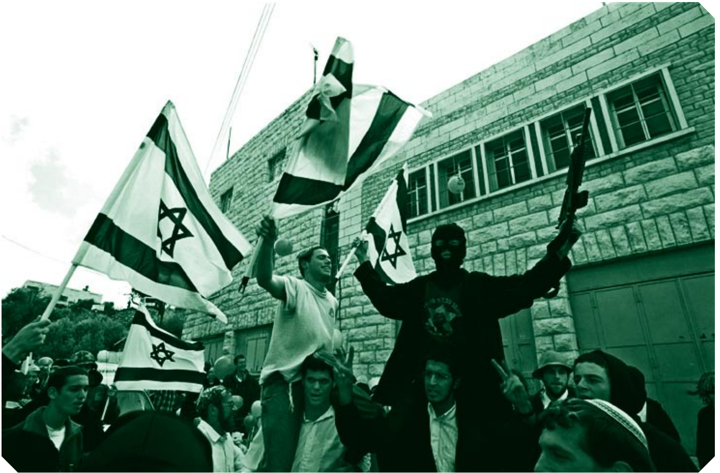
Armed settlers demonstrating in the Gaza Strip