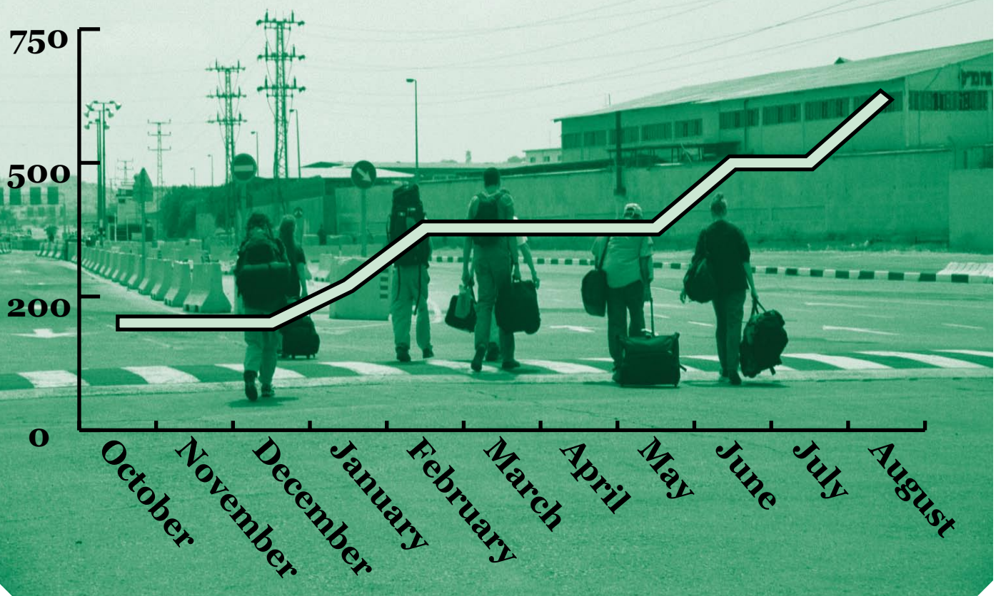
Graph 2: Average Compensation Sums per Family 2004-2005

One expression of the settlers' political resistance to the very idea of evacuation was their complete inaction regarding accommodations after the withdrawal. The government consequently took upon itself the parental role of providing the settlers with a very detailed plan for temporary housing. Although the settlers could select their own accommodations (and receive two years' worth of rent from the government), those